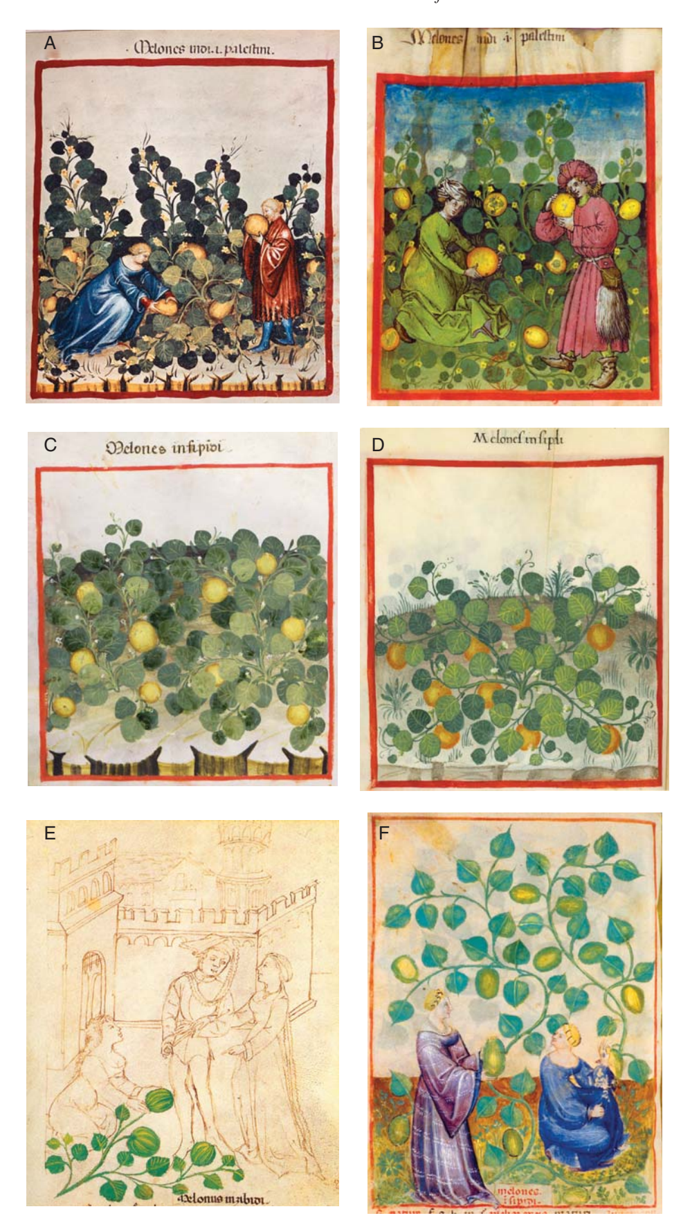
Fig. 3. Melons, Cucumis melo subsp. melo , possibly adana melons, depicted in the Tacuinum Sanitatis : (A) Vienna 2644 folio 22r; (B) Paris 9333 folio 19r; (C) Rome 4182 folio 36r; (D) Rouen 3054 folio 18v; (E) Liège 1041 folio 19r; (F) Paris 1673 folio 37v.