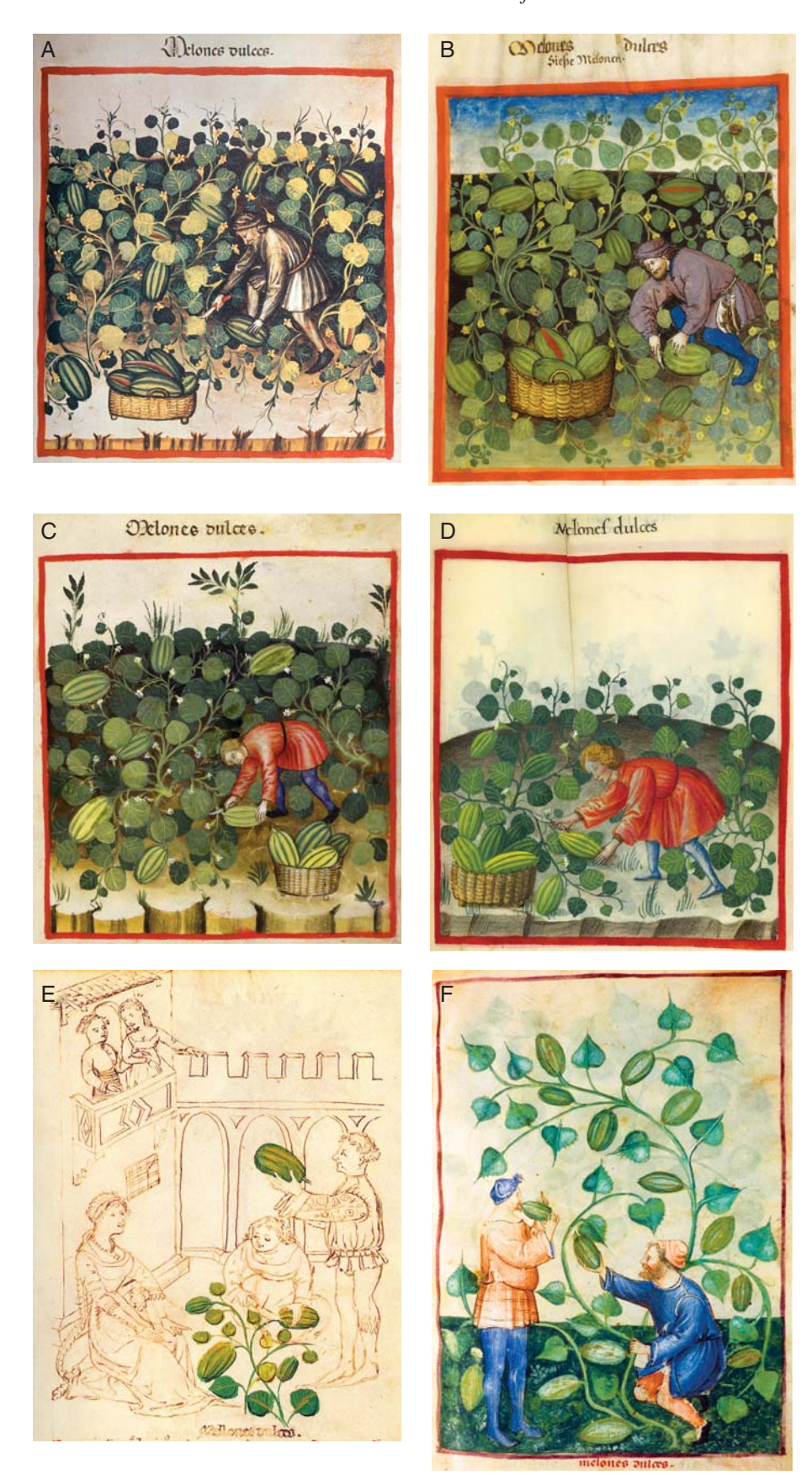
Fig. 4. Watermelons, Citrullus lanatus , depicted in the Tacuinum Sanitatis : (A) Vienna 2644 folio 21r; (B) Paris 9333 folio 18r; (C) Rome 4182 folio 35r; (D) Rouen 3054 folio 18r; (E) Liège 1041 folio 20r; (F) Paris 1673 folio 37r.