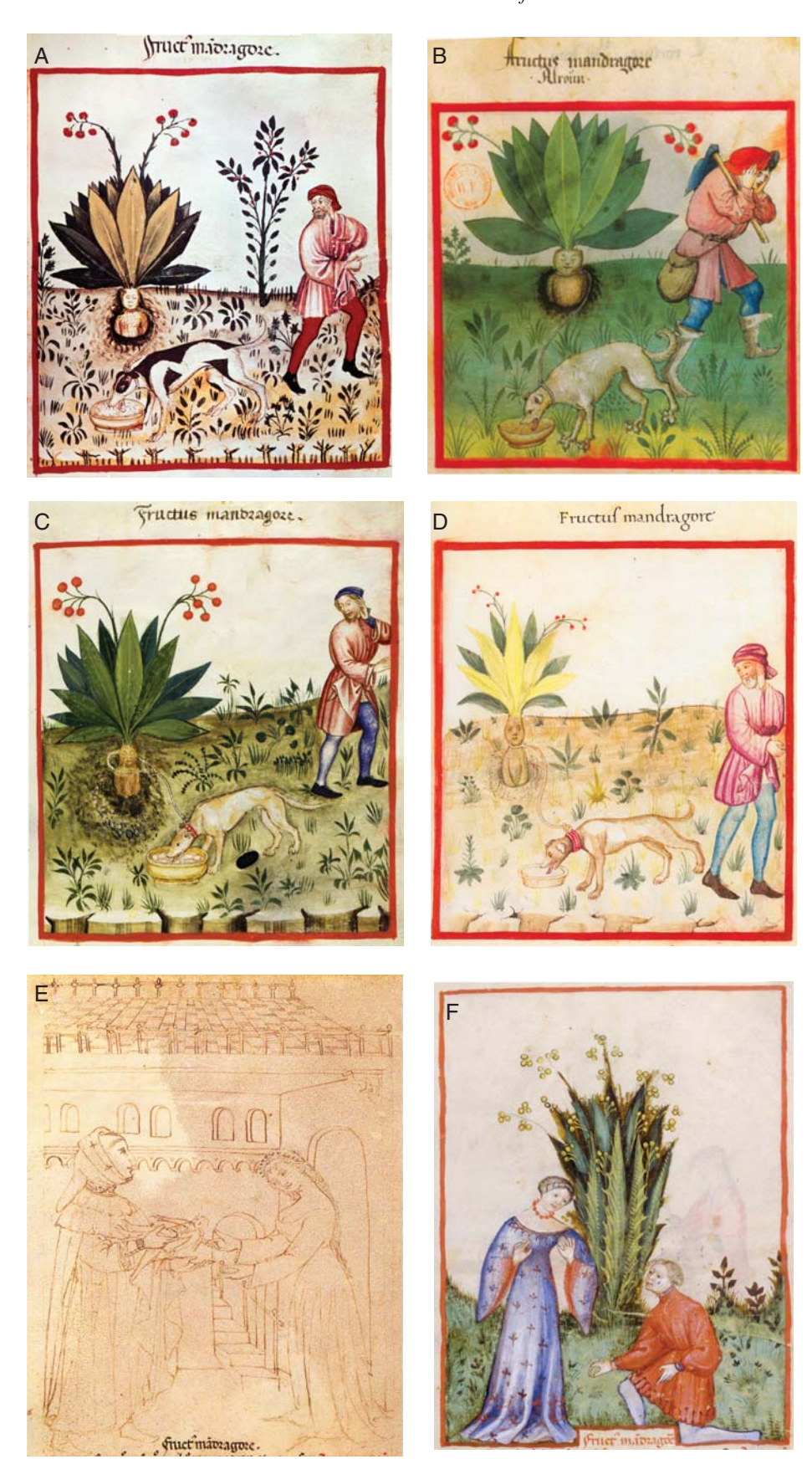
Fig. 8. Mandrake, Mandragora spp., depicted in the Tacuinum Sanitatis : (A) Vienna 2644 folio 40r; (B) Paris 9333 folio 37r; (C) Rome 4182 folio 73r; (D) Liechtenstein folio 13r; (E) Liège 1041 folio 16v; (F) Paris 1673 folio 85r.