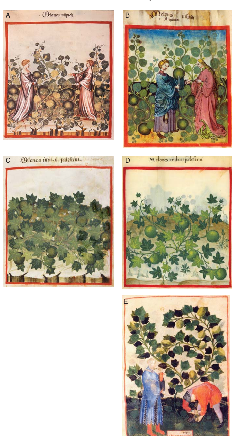
Fig. 5. Citron watermelons, Citrullus lanatus , depicted in the Tacuinum Sanitatis : (A) Vienna 2644 folio 21v; (B) Paris 9333 folio 18v; (C) Rome 4182 folio 37r; (D) Rouen 3054 folio 19r; (E) Paris 1673 folio 38r.