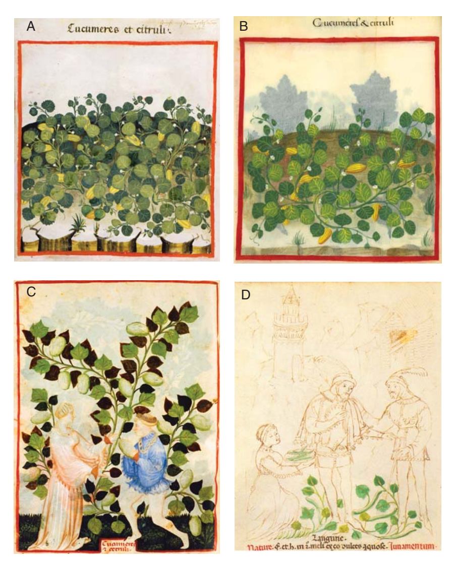
Fig. 2. Melons, Cucumis melo subsp. melo , depicted in the Tacuinum Sanitatis : (A, B) Chate melons (Rome 4182 folio 40r, A; Rouen 3054 folio 20v, B); (C) casaba melons (Paris 1673 folio 38v); (D) snake melons (Liège 1041 folio 19v).

(4) Vienna 2644 folio 22r (Fig. 3A) depicts several plants growing in a garden with the label Melones indi i palestini. The vines are not dense, have cordate leaf laminae, small yellow flowers, and bear round, entirely yellow fruits slightly larger than a person's head. Two people are among the vines. A lady dressed in a blue gown is picking a fruit and a man in a red tunic with blue tights holds a fruit to his nose, indicating that the fruits are aromatic. The shape, colour and fragrance of the fruits leave no doubt that a type of melon, Cucumis melo, is depicted. The scenery in Paris 9333 folio 19r (Fig. 3B) hardly differs except for the clothing, lack of soil cracks, and green colouration of the ground. An entirely different depiction is given the same label, Melones indi i palestini, in the Rome 4182 and Rouen 3054 manuscripts (see below), but similar depictions are labelled Melones insipidi for Rome 4182 folio 36r (Fig. 3C) and for Rouen 3054 folio 18v (Fig. 3D). Evidently, the images