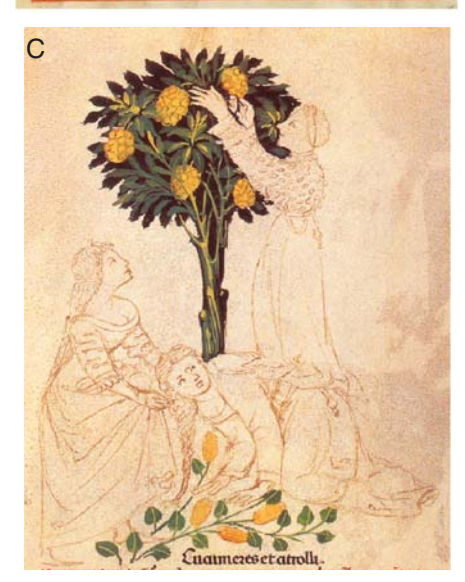
Fig. 1. Cucumbers, Cucumis sativus , depicted in the Tacuinum Sanitatis : (A) Vienna 2644 folio 23v, (B) Paris 9333 folio 20v, (C) Liège 1041 folio 20v.