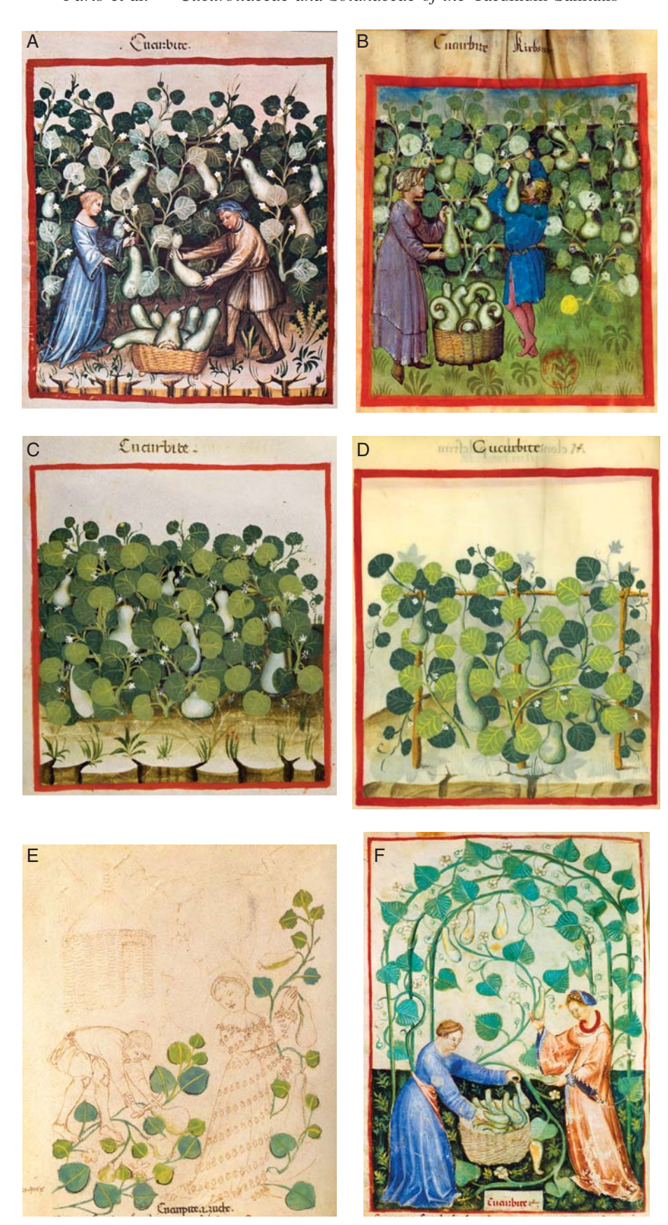
Fig. 6. Calabash or bottle gourds, Lagenaria siceraria , depicted in the Tacuinum Sanitatis : (A) Vienna 2644 folio 22v; (B) Paris 9333 folio 19v; (C) Rome 4182 folio 38r; (D) Rouen 3054 folio 19v; (E) Liège 1041 folio 18v; (F) Paris 1673 folio 36v.